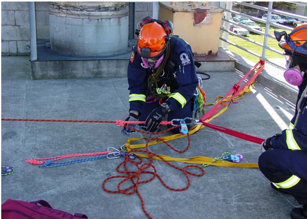
Above: Members of RT9 begin rigging a reeving highline by which to remove victims from site during Exercise Pegasus, September 2004.